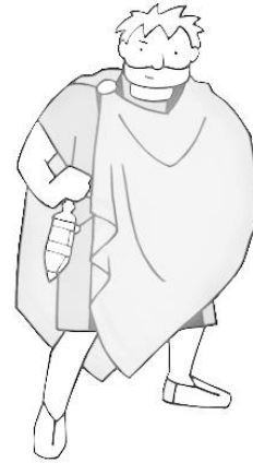
Simon the Zealot