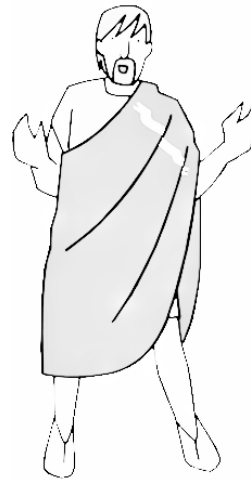
James Son of Alphaeus